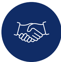
Inclusive & collaborative

GS1 standards help companies and organisations improve the efficiency, safety and visibility across their physical and digital channels. They enable interoperability between stakeholder systems, support local regulatory compliance, and ultimately facilitate digitisation.