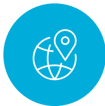
Global & local