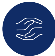
Neutral & not-for-profit