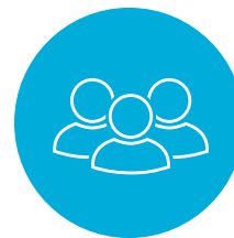
User-driven & governed